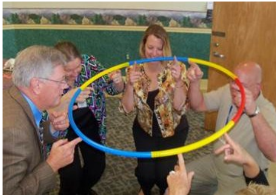
RCEA participants learn how difficult it is to coordinate team actions in maneuvering a hula-hoop during a recent RCEA meeting

The Roane County Employer’s Association (RCEA) provides HR and operations managers the opportunity to stay up-to-date with many issues facing businesses in Roane County and great networking opportunities.