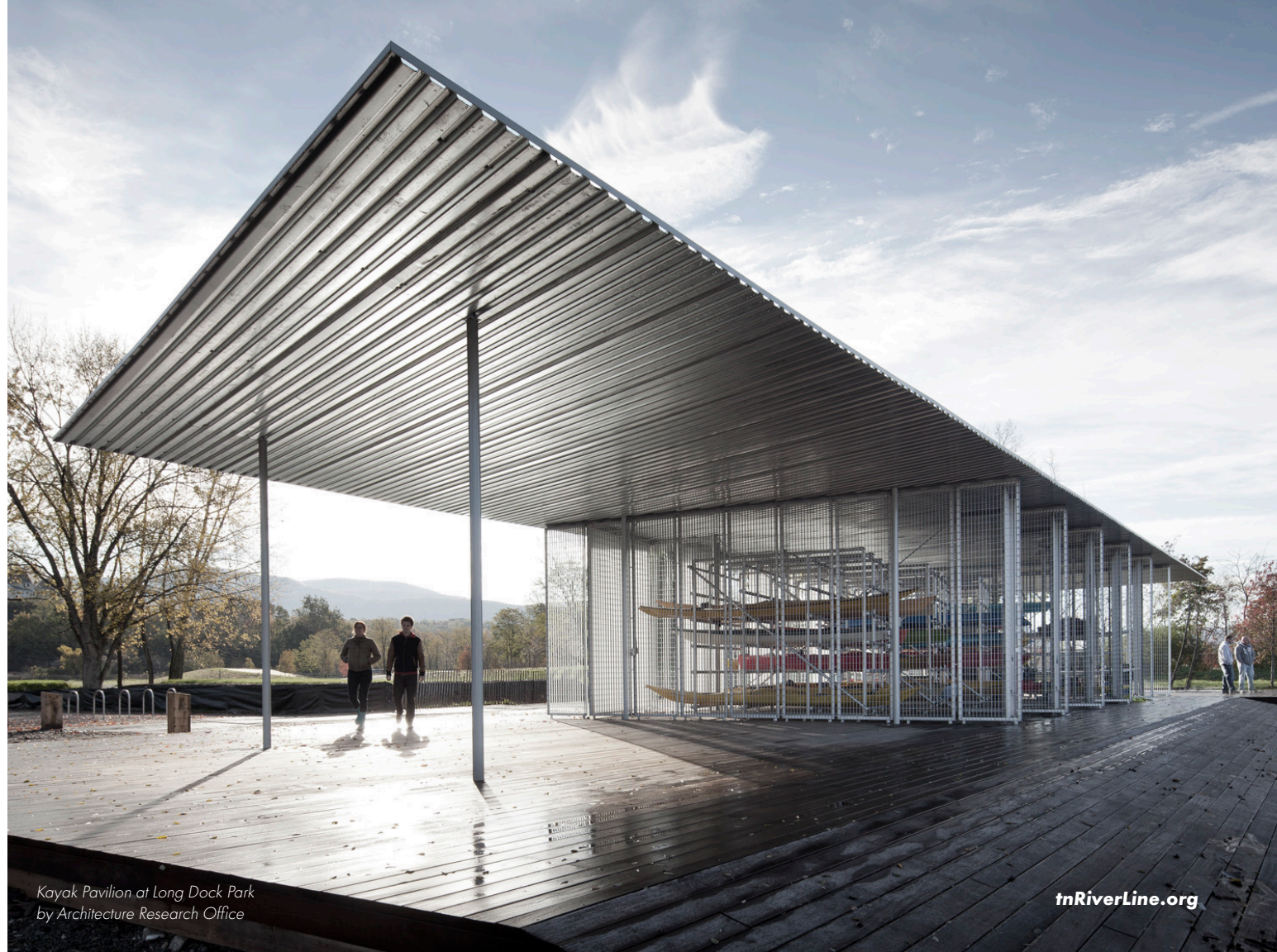
Kayak Pavilion at Long Dock Park by Architecture Research Office