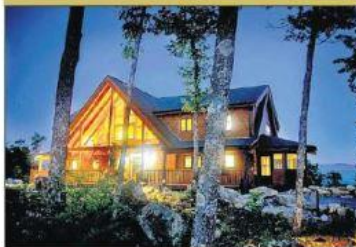
Chilhowee Mountain Retreat was named one of the Top 10 Southern Mountain Resorts and Inns by USA Today.