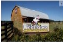
The Udder Story Barn at Sweetwater Valley Farm houses an exhibit explaining the past, present and future of dairying. CONTRIBUTED BY ... Read More

www.tennesseerivervalleygeotourism.org. Plan trips at www.tnvacation.com/eaast.