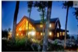
Chilhowee Mountain Retreat was named one of the Top 10 Southern Mountain Resorts and Inns by USA Today. CONTRIBUTED BY WWW.CHILHOWEEMOUNTAINRETREAT.COM

several lakes. 1211 U.S. 321 N., Lenoir City. 865-986-0295. www.choicehotels.com.