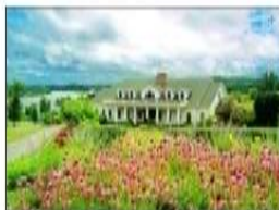
Whitestone is one of only five AAA Four-Diamond Inns in Tennessee, and was named one of the "10 Most Romantic Inns ... Read More

Stay: Unplug at the Chilhowee Mountain Retreat, located in Blount County. The luxury adults-only (21 and older) bed-and-breakfast offers panoramic Smoky Mountain views, covered wraparound porches with rocking chairs, a reading loft and hot tub. The Great Room features a soaring stone fireplace and exposed log beams. Even the lighting in the three guest rooms is considered for comfort — along with king beds, two-person air-jet tubs, steam showers with rainheads, robes, towel warmers